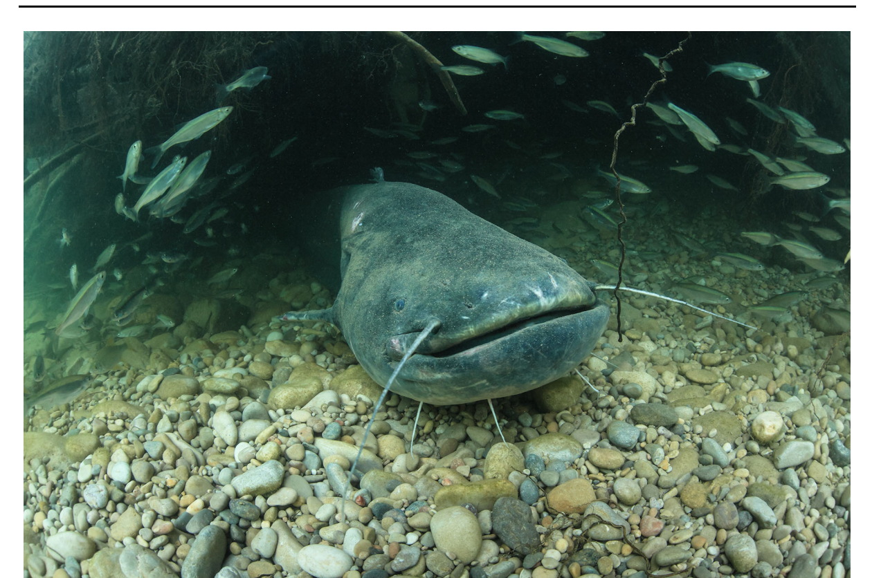
Fig. 2 A large, close to 2 m long, European catfish (Silurus glanis) in a natural Southern European river.