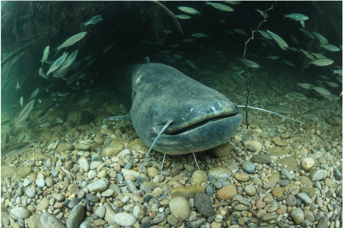
Fig. 2 A large, close to 2 m long, European catfish ( Silurus glanis ) in a natural Southern European river.

interaction of diel cycle and temperature only partially explains some of the behavioural patterns of European catfish, with use of electromyogram (EMG) tags showing that there is considerable individual variability in behaviours. For example, some tagged individuals had energy utilisation patterns that showed little pattern with the phase of the diurnal cycle, with peak activity use during specific periods of the day or the night (Slavík and Horký 2012). It was suggested that rather than being related to day/night phases, their behaviours were more related to their individual characteristics, and corresponded to the theory of behavioural syndromes and the classification of individuals into groups of proactive and active individuals with different abilities to use energy reserves (Øverli et al. 2005). The influence of these different behavioural syndromes could have substantial consequences for the outcome of introductions, as these potentially have strong influences on the ability of released individuals to establish new populations and colonise new regions (Chapple et al. 2012). Correspondingly, individual differences in behaviour and